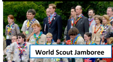
World Scout Jamboree