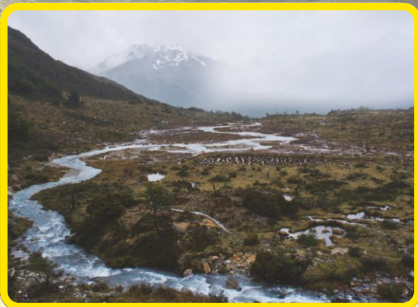
A Howl at Dusk