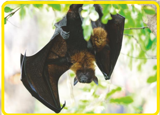
Bats Under the Bridge