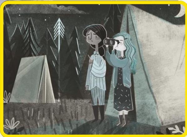
A Noise in the Night