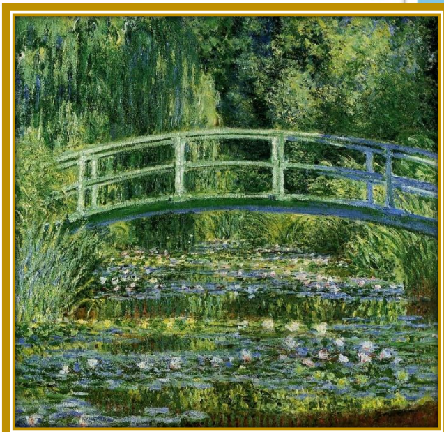
Water Lilies and the Japanese Bridge, 1897 - 1899

Born: 14 th November 1840 Died: 5 th December 1926 Nationality: French Profession: Painter Key Words Impressionism Paints Fast brushstrokes Oils Movement Light