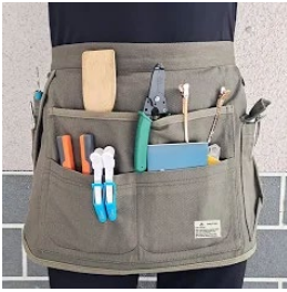
BBQ aprons with pouches